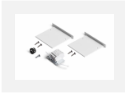
04-00101, S 2xend cap - metal, 5- conductor terminal box, grommet