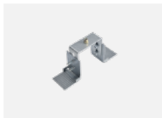
04-20900, F bracket for installation of suspended type of profile as recessed trimless