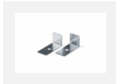
04-01200, F Accessory for gear-tray release