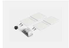
04-20102, W 2xend cap - plastic, 3- conductor terminal box, grommet