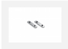
04-00200, N straight connector