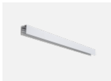
04-21307, W pendant profile for track luminaires; l = 2242mm