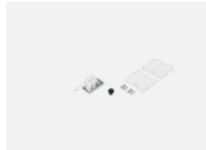
04-20100, W 2xend cap - metal, 3- conductor terminal box, grommet