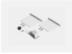
00-00100, W 2xend cap - metal, 3- conductor terminal box, grommet; Lipo80