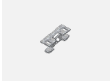
00-00600, F ceiling fastening for luminaires 132-5xxK, 04-2000x, 05-2000x, 09-200x - 1 piece