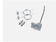
00-51300, W set for suspension into 3-phase track, non- dimmable luminaires