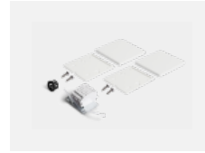
00-20101, W 2xend cap - metal, 5- conductor terminal box, grommet; Lipo80/Lina80