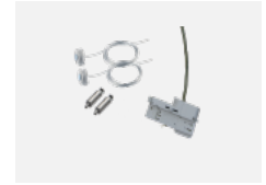
00-51301, W set for suspension into 3-phase track, dimmable luminaires