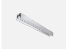
00-21300, W Lipo80-S, Lina80-S - pendant profile for track luminaires; l = 1122mm