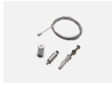
00-00302, N wire suspension 6000mm