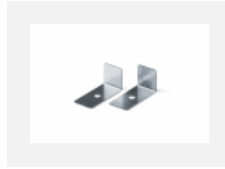
00-01200, F Accessory for gear-tray release