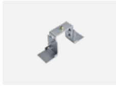
00-20900, F bracket for installation of suspended type of profile as recessed trimless