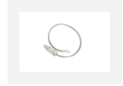
101-0013, B transparent cable 3x 0,75 mm, 2m with WAGO connector