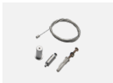
01-0007, N wire suspension 2000mm