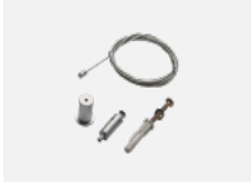
01-0007, N wire suspension 2000mm