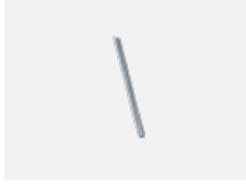
00-00352, K cable 3x0,75 2000mm