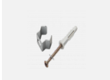
108-0002, F wall fastening for 108-301K