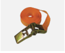
108-0004 Tie-down strap for INDI circle