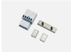
132-50200, F straight connector