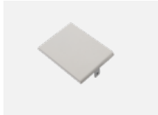
132-50100, B end cap