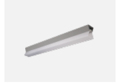
132-50031, B pendant profile 1000 mm