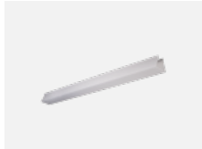
132-51100, K diffuser 2295 mm