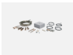
00-00344, W suspension set 6000mm, 4 pcs.of wires, cable 5x0,75mm, ceiling cup